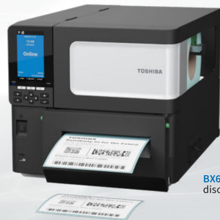
BX610T + optional disc cutter